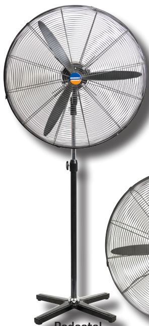
Pedestal Item No: KK13006

A must have product in your stores over summer as the weather gets hotter the Kincrome range of Industrial Fans are top quality and built to stand up to constant use in the tough workshop environment.