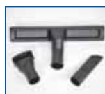
Accessories – Floor Nozzle, Dust Brush, Crevice Nozzle