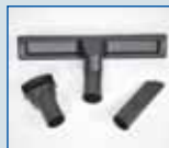
Accessories – Floor Nozzle, Dust Brush, Crevice Nozzle