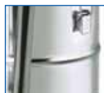
Stainless Steel Tank